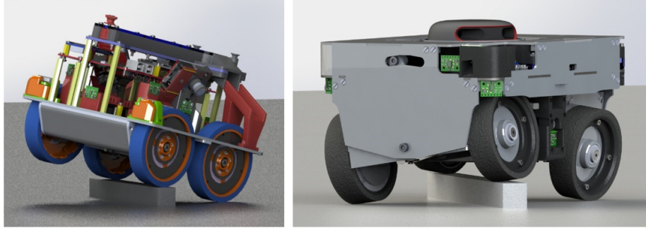
Fig. 4. Comparison of our robot that took part in 2019 (left) with the current development (right).

The competition robot for the new season is considerably more complex than the developments of previous years. The development of the design with the suspension fitting into such a small size caused a lot of difficulties, it took us twice as much time as the development of the previous season's robot.